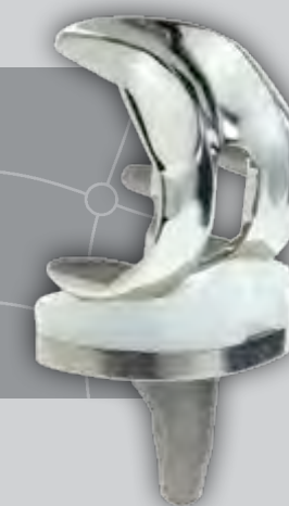
Optetrak CR Slope®

You determine the best course for your patients. GPS can help provide a custom-fit knee with less pain, faster recovery and a less invasive approach.