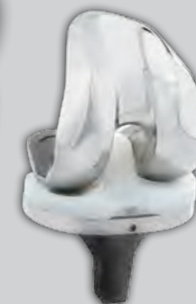
Optetrak Logic® PS